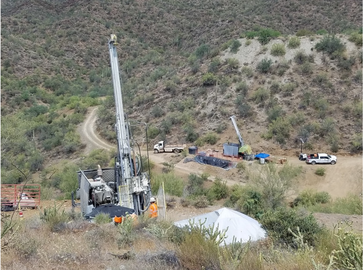
Figure 1. Drill rigs turning at Kay Mine Phase 2 Expansion Program